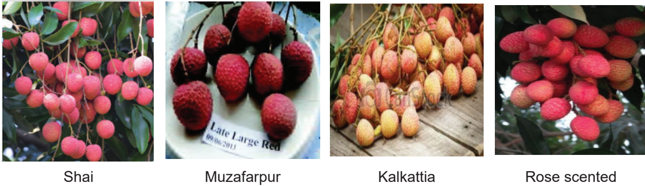
Fig. 1. Registered varieties of Litchi

Kalkattia : Late season and regular bearing habit variety have medium to large sized attractive fruit which has high total soluble solid content (19-22 oBrix). It is small size tree high yielding (80-100 kg per tree) with heavy bearing.