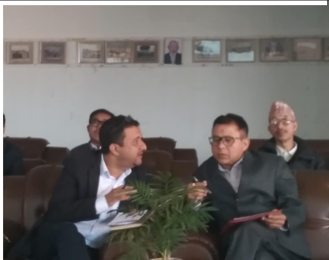
Technical Panels in the Technical paper presentation on the 2nd day of the 15th NHS, 2024