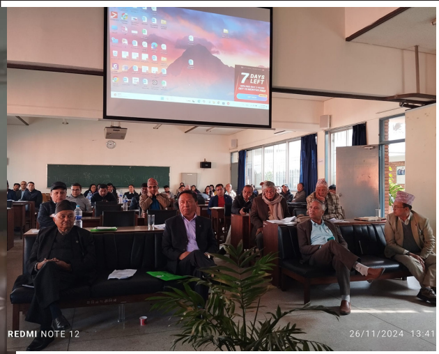
Participants at the closing ceremony of the 15th National Horticulture Seminar, 2024