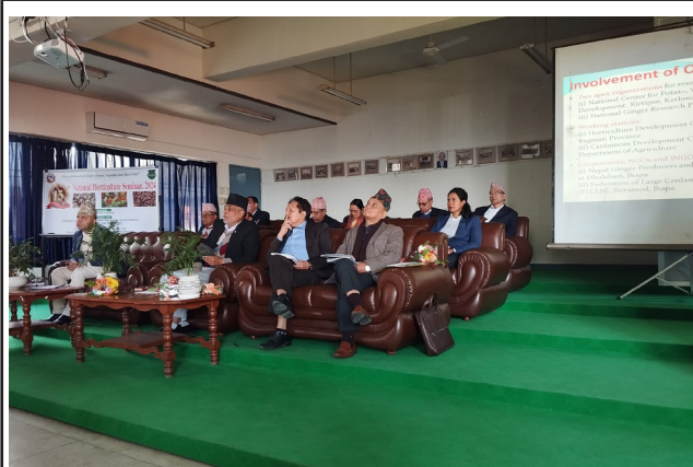
Chief guest, special guest, guest and chairperson taking seat in the seminar