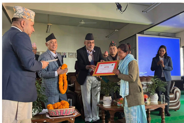
Chief Guest Hon'ble Minister, MoALD presenting the Best Vegetable Seed Grower Award of the year 2081