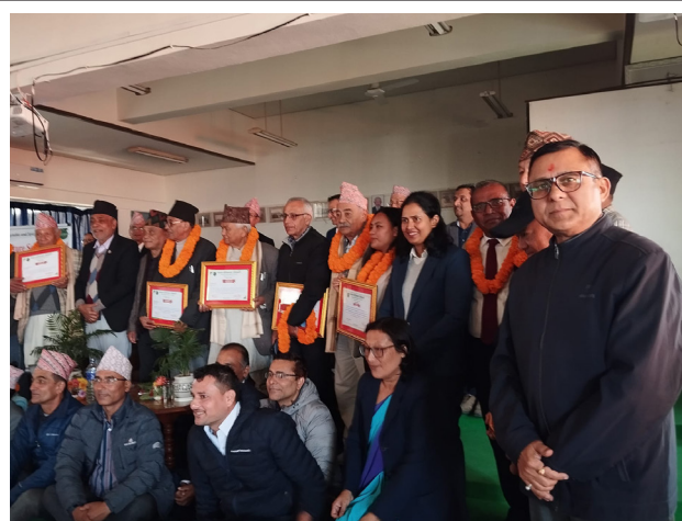
Group Photo with the awardee and honored horticulture experts in the 15th NHS-2081