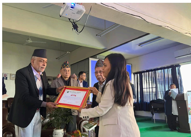
Chief Guest presenting the MSc. Ag. (Horticulture) Topper Student Excellence Award of the year 2081