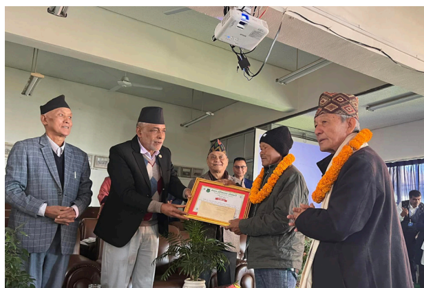
Chief Guest Hon'ble Minister, MoALD presenting the Best Organic Grower Award of the year 2081